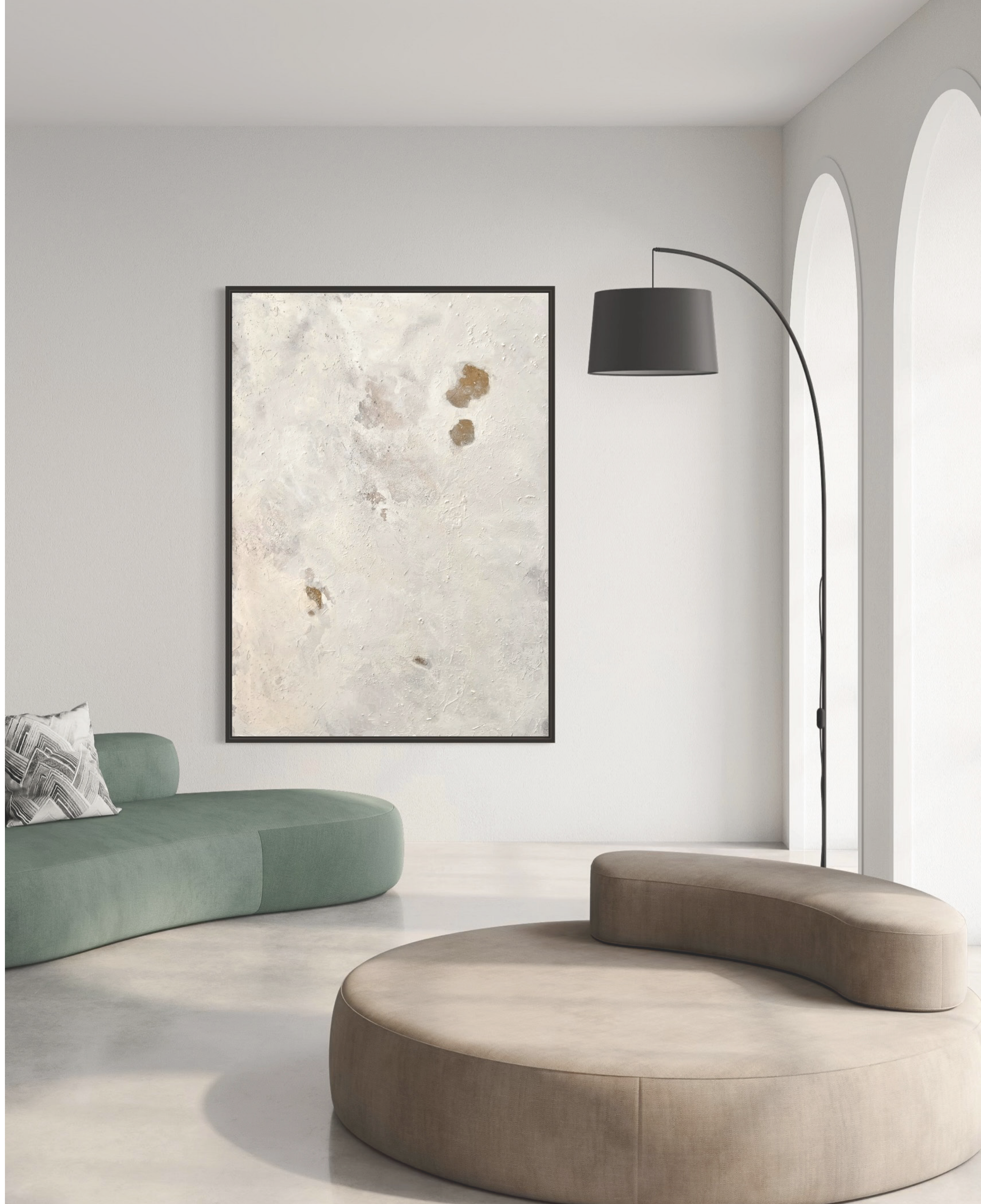
'ESTRONC' | 1.71x1.22m 2750,-