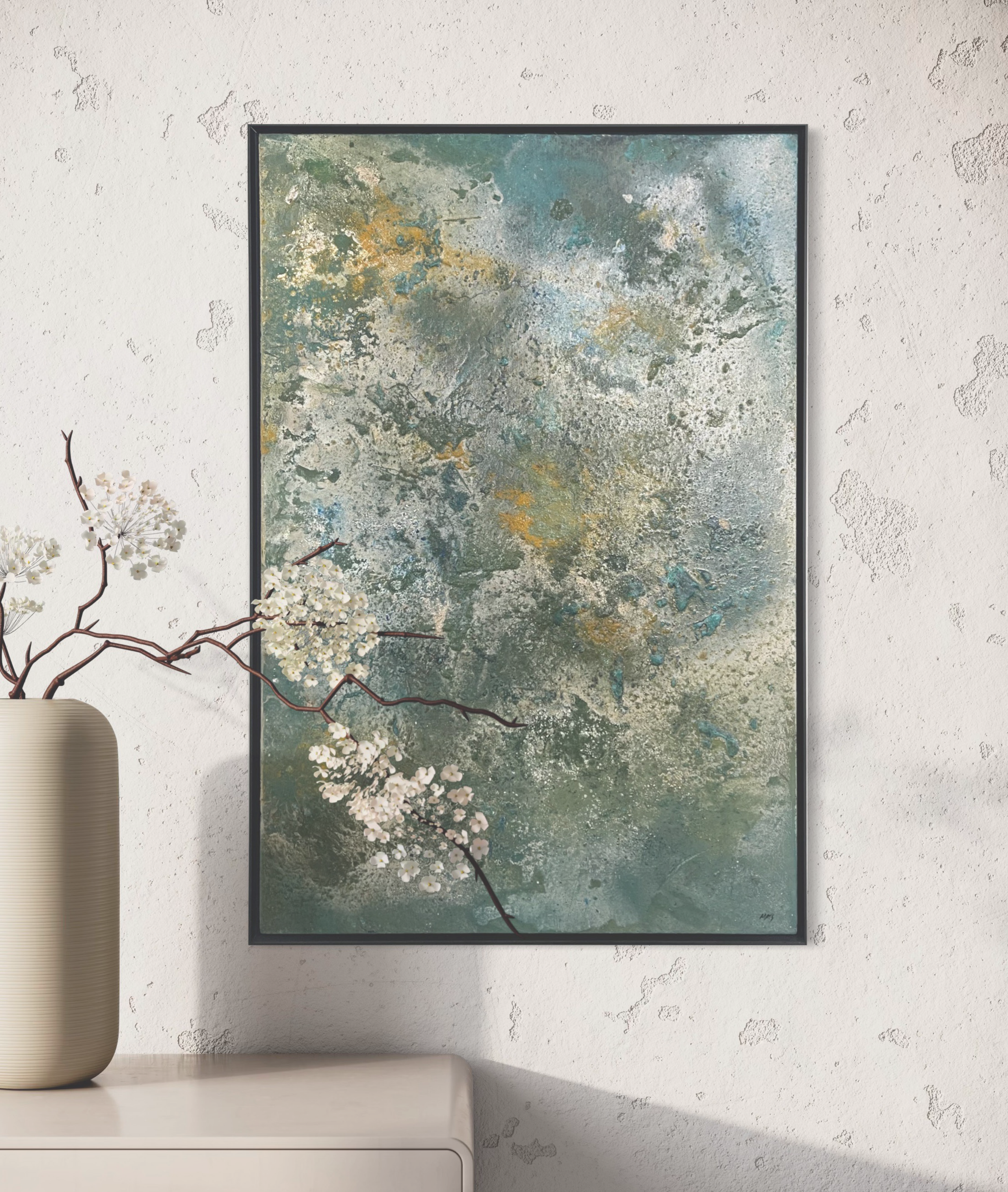
'SHIZEN' | 1110x80m Sold