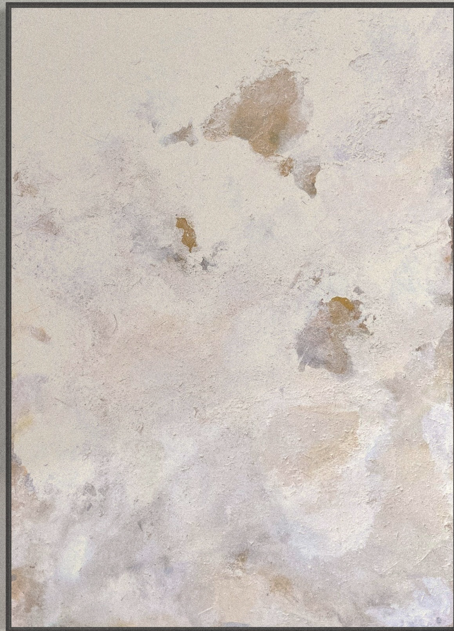
'CAP SIS' | 171x122cm 2750,-