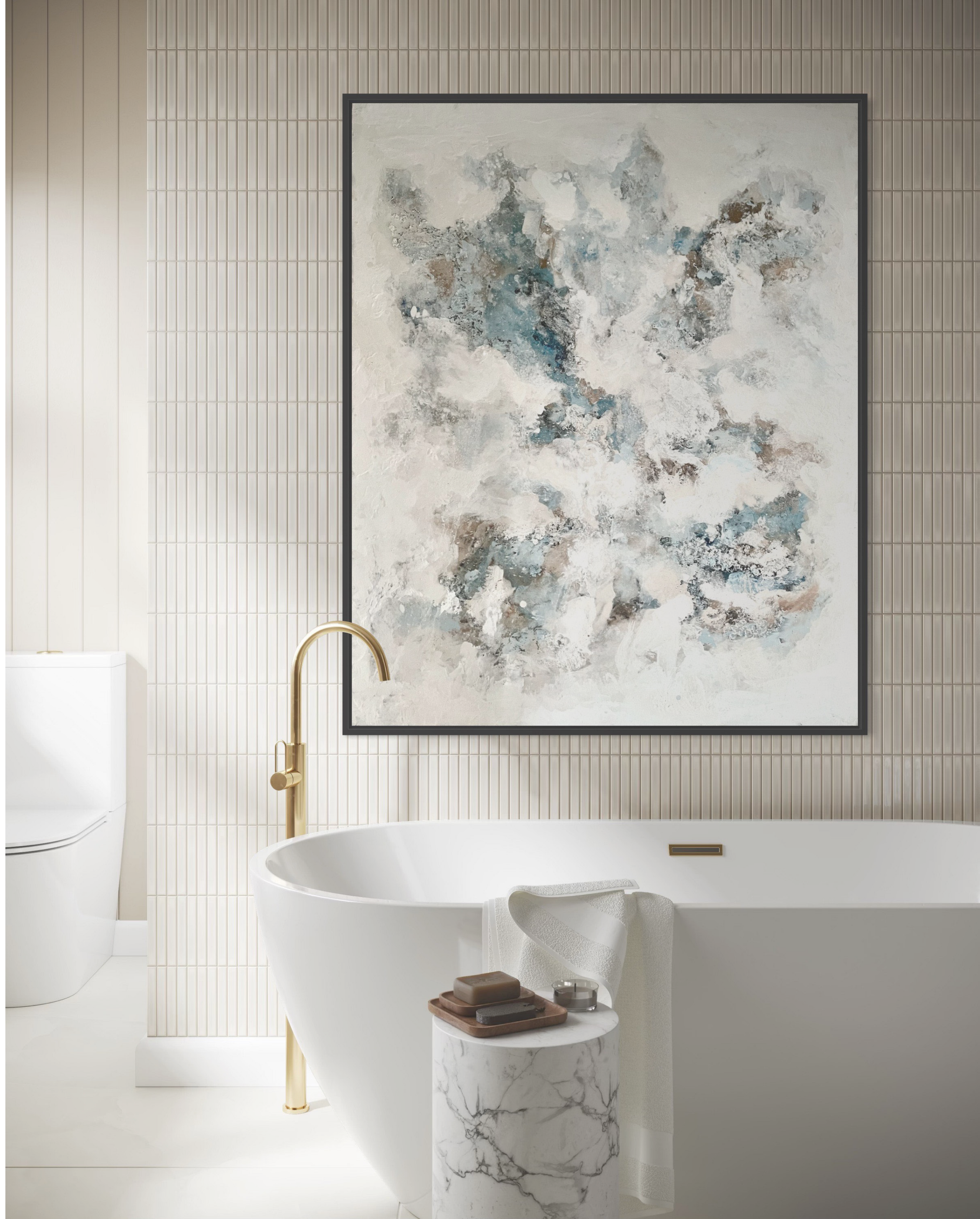
'INERTIA II' | 1.80x1.40m Sold