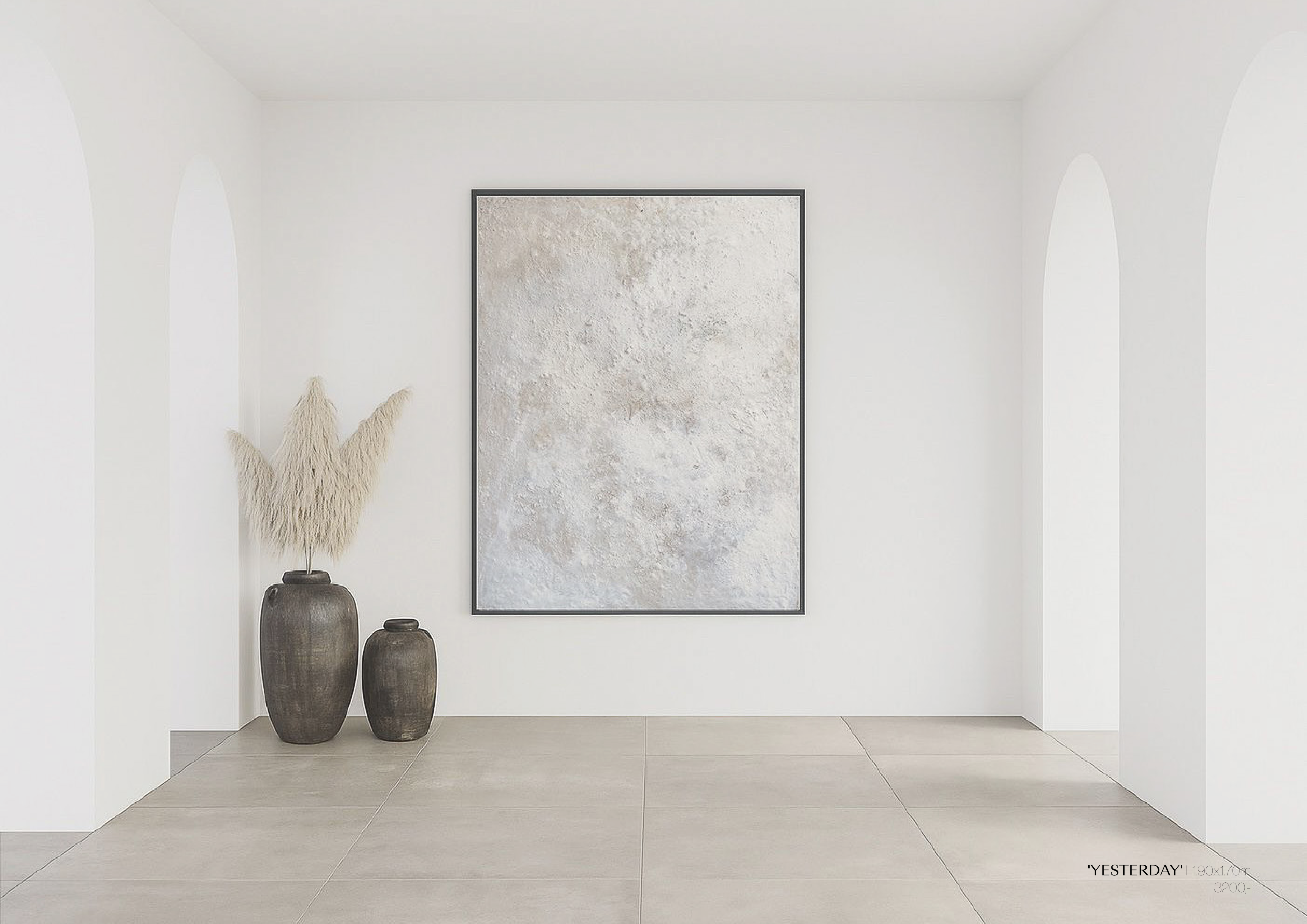
'YESTERDAY' | 190x170cm 3200,-