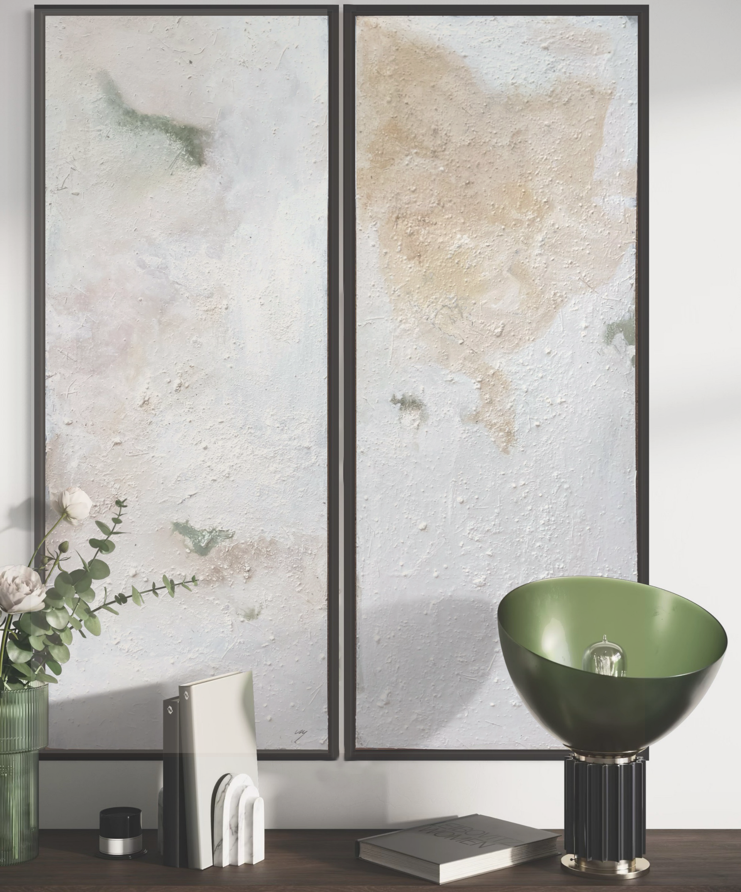
'SUAVE' | 1.90x70m 2200,-