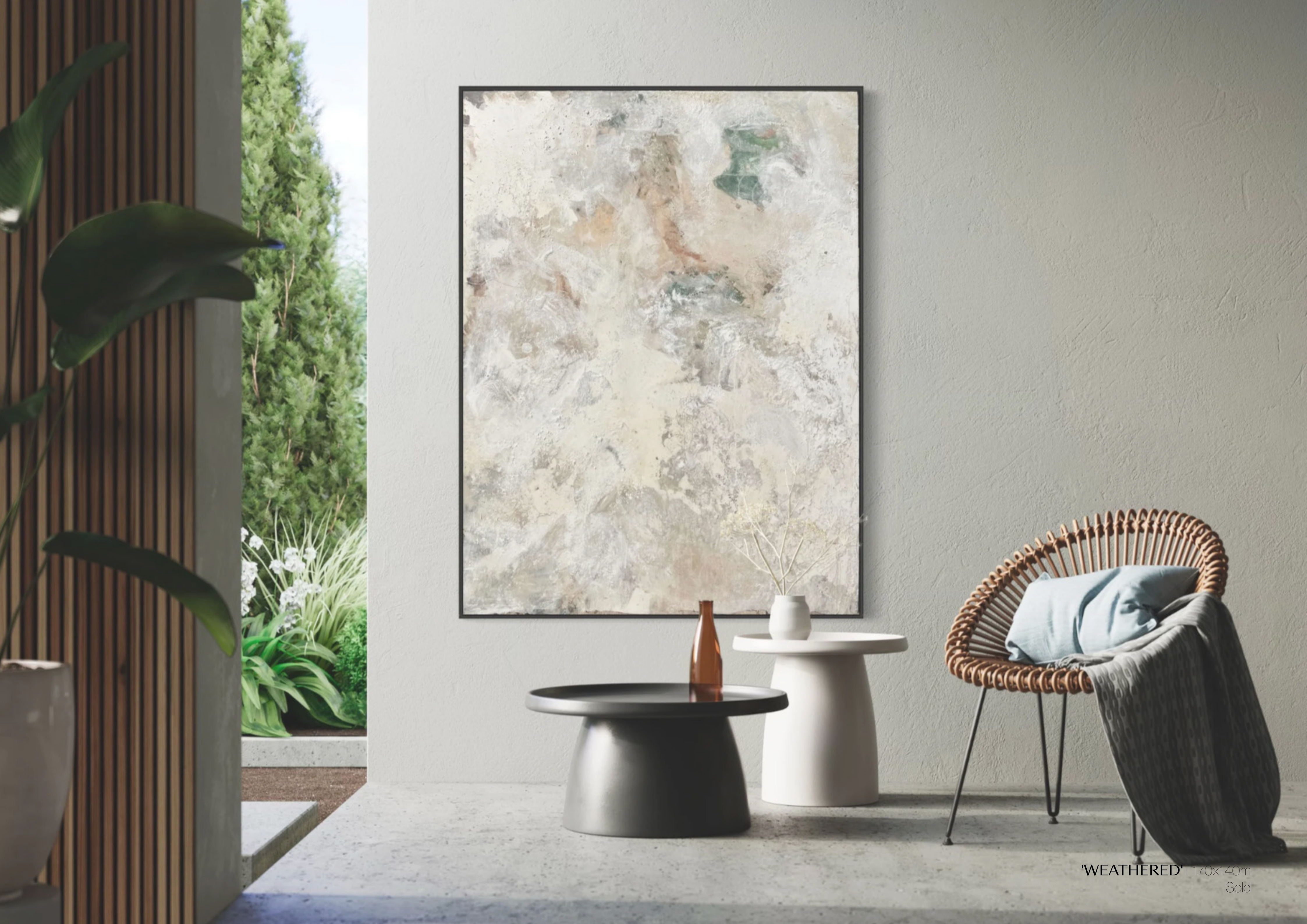
'WEATHERED' 1170x140cm Sold