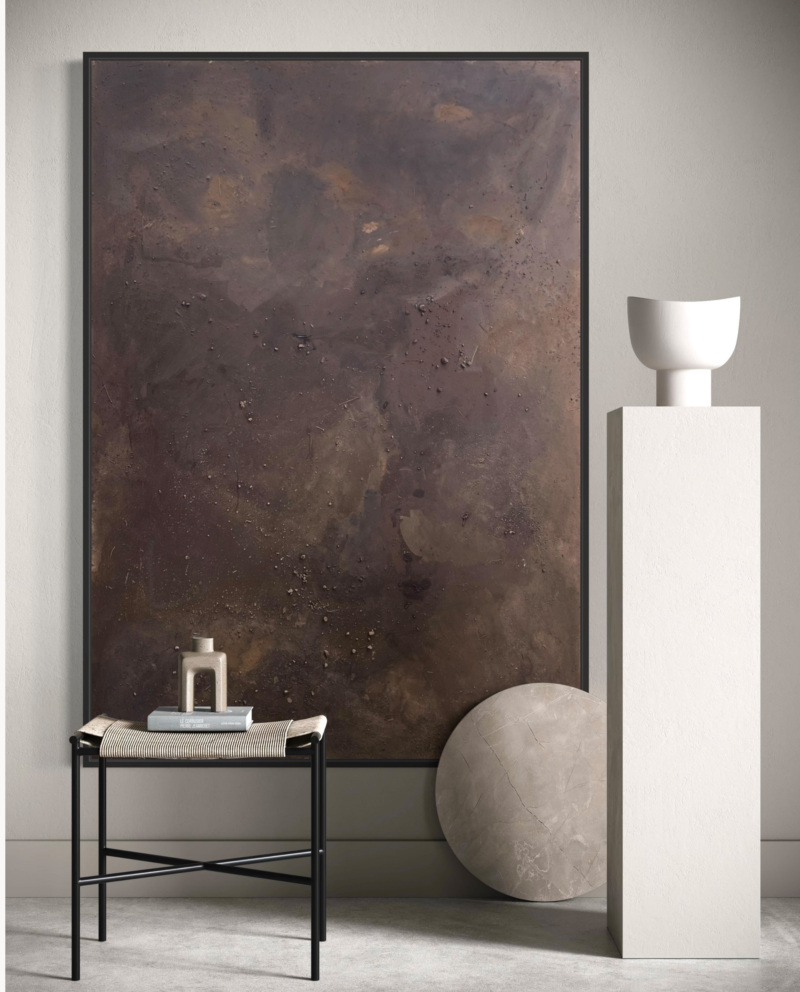
'BACKWARDS' | 1.71x1.22m 2750,-